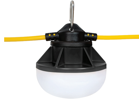
LED CordLights (High Lumen Output, 2,000 Lumens per Module) Part Number: 16050