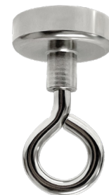
Magnetic Suspension Hangers for LED CordLight Maximum holding force - 22 lbs. Part Number: CORDLIGHT-MH