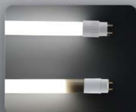
Other LED Tubes