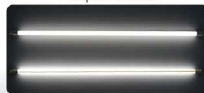
Lamp Back View