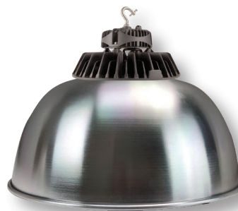
LED Round High Bay with aluminum reflector