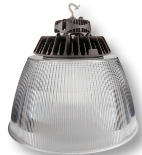
LED Round High Bay with acrylic refractor