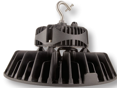
LED Round High Bay