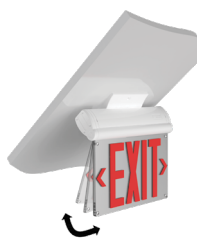
Rotate angle from 0° to 180° Sloped Mount

NOTES 1 See spec sheet ELA-Stemkits. Only available for surface mount. Not available for recessed mount.