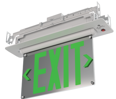
Universal Mount (UM)