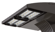
HS - House-side shields