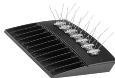
BSW - Bird-deterrent spikes