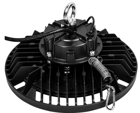
Safety Cable with Carabiner Clip